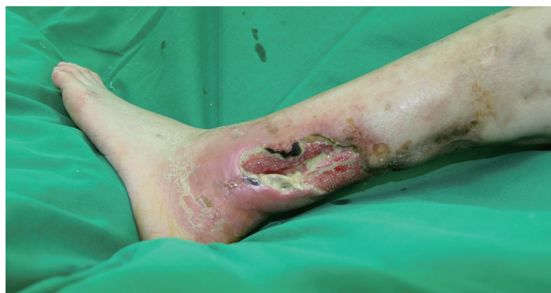
Fig. 1. Multiple left leg defects. The left leg defects shown here are arose from calcinosis, which occurred in both legs.

A 37-year-old female patient, who had suffered from SLE for 16 years, had acquired progressive calcifications on the entirety of both of her legs. The calcification lesions were initially not severe and were