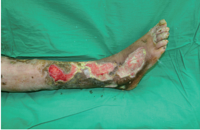
Fig. 2. Multiple right leg defects. The right leg defects shown here are arose from calcinosis, which occurred in both legs.