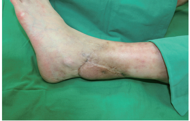
Fig. 4. Postoperative view of the left leg. The left leg is shown after coverage of the defect with a thoracodorsal perforator free flap.