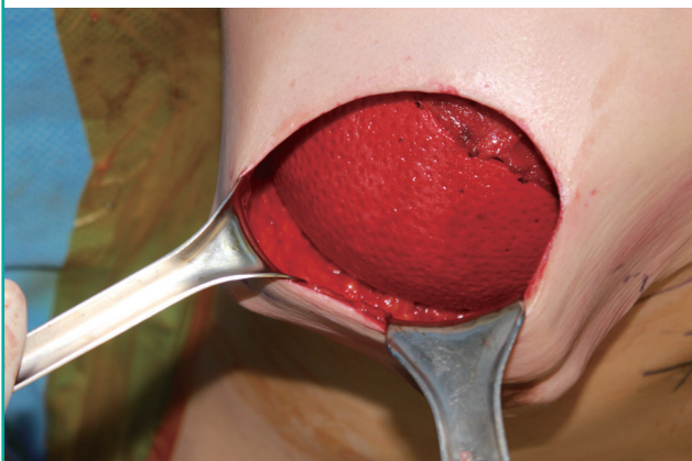
Fig. 2. Infection after implant-based immediate breast reconstruction

The superior border of the ADM was sutured to the inferior border of the pectoralis major with an interrupted 3-0 synthetic monofilament absorbable polyester. Total implant coverage was obtained. ADM, acellular dermal matrix.