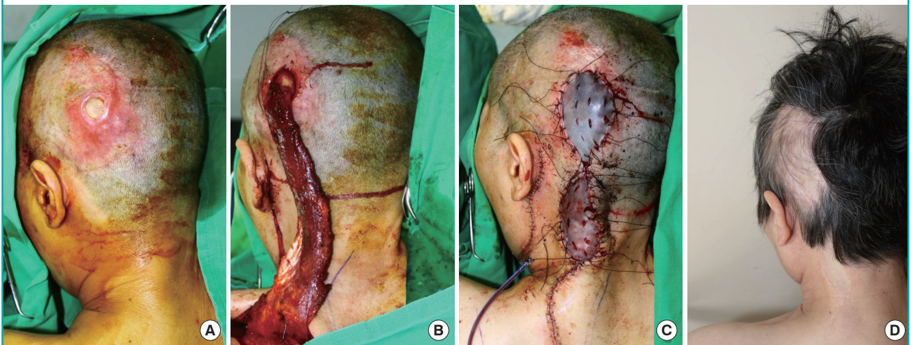
Fig. 2. Posterior neck defect (case 2, patient 10)

A 62-year-old woman presented with a skin and soft tissue defect involving an exposed implanted cranioplasty prosthesis (Medpor) on her posterior scalp. (A) The defect size was 4 \times 4 cm 2 . The exposed cranioplasty prosthesis was visible through the wound opening. (B) Following massive debridement due to a surrounding infection, a 27 \times 6 -cm 2 trapezius muscle flap based on the superior cervical artery was elevated and transferred to the defect without subcutaneous tunneling. (C) The flap donor site and posterior neck incision for flap placement were closed with minimal subcutaneous undermining. An autologous split-thickness skin graft was laid on the remnant skin defect above the exposed muscle flap. (D) Seventeen-month postoperative results showing not only healing of the trapezius muscle flap and overlaid graft but also contouring with adequate thickness and good harmony with the surrounding tissue.