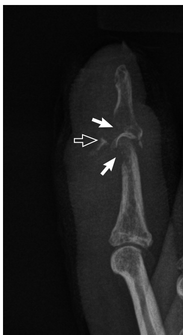
Fig. 2. Case 1: lateral finger radiograph follow-up

A 57-year-old female patient with osteomyelitis and infectious arthritis of the right third finger after a cat bite. Lateral finger radiograph shows soft tissue swelling, bony destruction (arrows) of the middle and distal phalanges, and narrowing of the distal interphalangeal (DIP) joint space. Note the free bony fragment (open arrow) on the volar aspect of the finger.