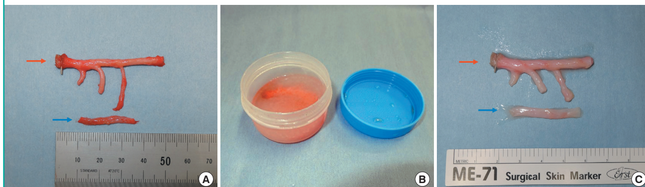
Table 1. Preserved vessels for microsurgical training

(A) Artery and vein harvested and trimmed from resected tissues except examined lymph nodes in lymph node dissection. Red and blue arrows indicate the artery and vein, respectively. (B) Vessels shown in Fig. 1A placed in a small specimen container with sterile saline and stored in a freezer. (C) Vessels shown in Fig. 1A defrosted with hot water after 3 days. Red and blue arrows indicate the artery and vein, respectively.