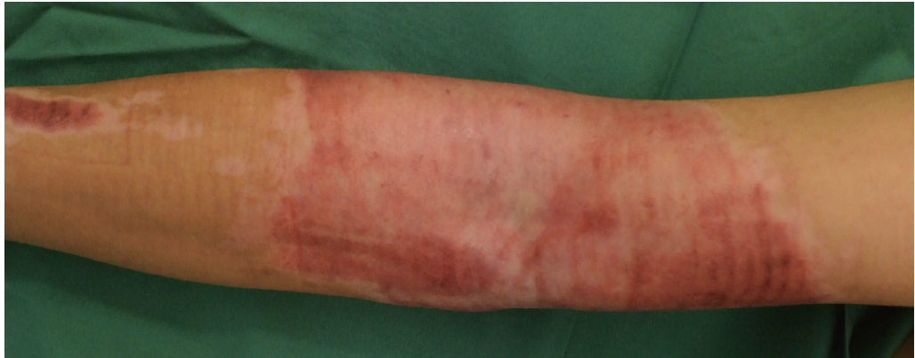
Fig. 3. Four-week postoperative image, showing complete healing without re-excision or skin grafting.