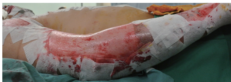
Fig. 2. The burnt area was tangentially excised with a Zimmer air dermatome set to 18/1,000 cm. Punctate bleeding was observed, and the litmus test showed a neutral pH. Biobrane was applied in the standard fashion.