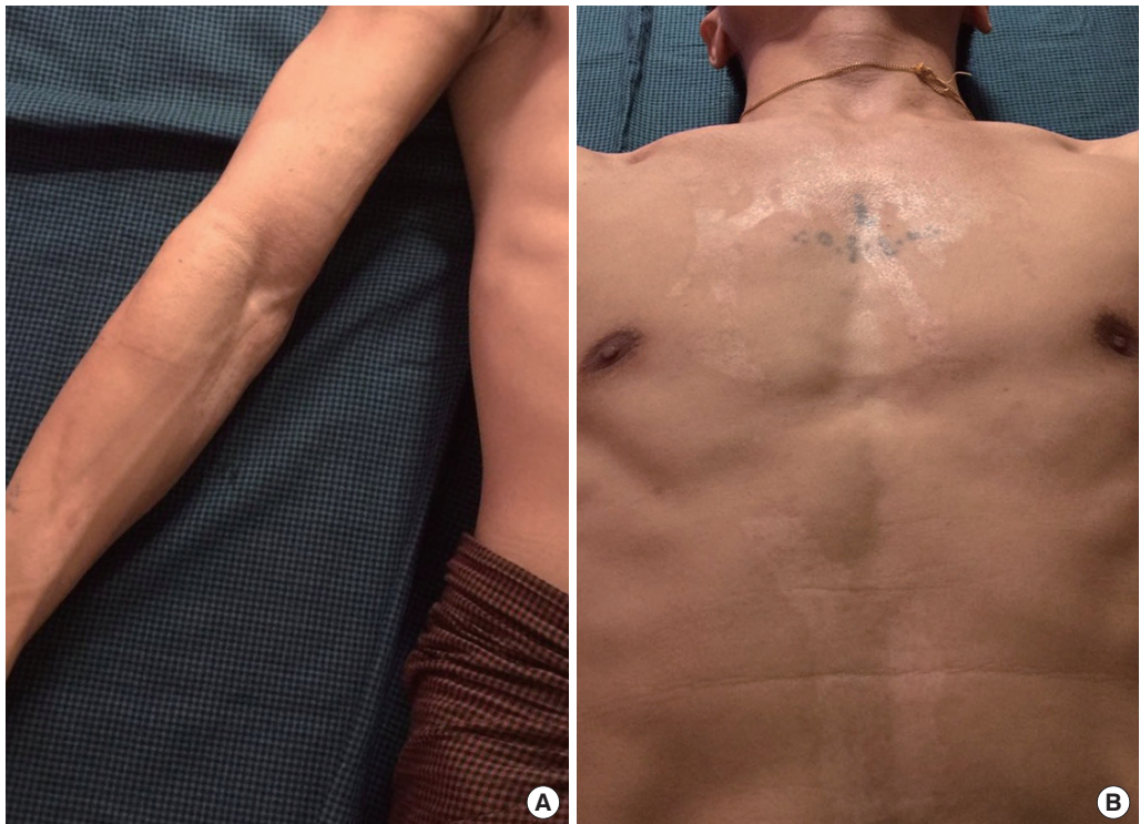
Fig. 4. (A) Right hand. (B) Thorax. The 1-year follow-up revealed a similar color to that of the surrounding skin, smooth surface, no contracture, good elasticity, and full range of movement with minimal scars.

tangential excision of alkali-devitalized tissue is necessary. The wound bed must be clean and neutralized, and a layer of dermis must be preserved for fibrin to bind to the applied Biobrane [2].