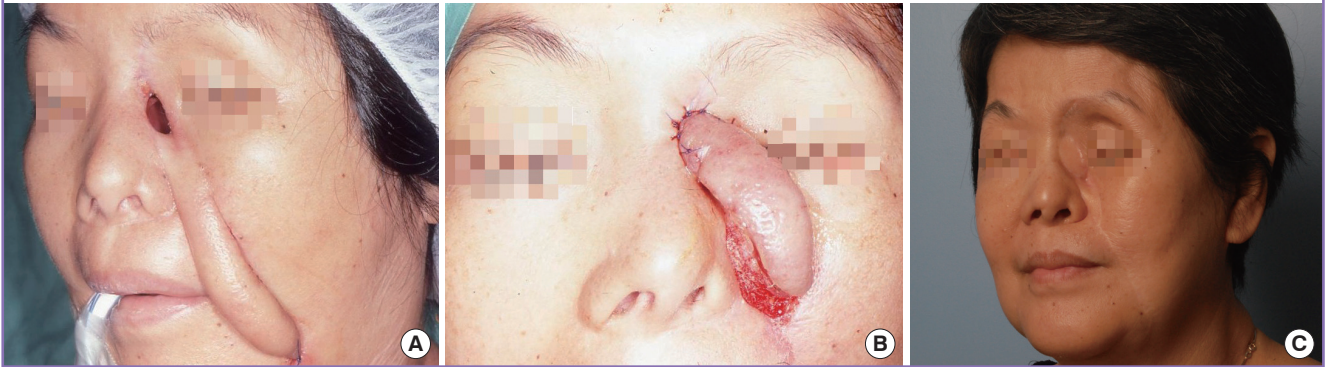
Fig. 3. Case 3

A 44-year-old woman (patient 3) with dehiscence of a Weber-Ferguson incision that resulted in a left medial canthal defect. (A) An "ultra-long" nasolabial flap was raised in a bipediced fashion and delayed. The raw undersurface of the flap was skin-grafted. (B) The flap was rotated upwards and the pre-grafted tip surface was used to reconstruct the vestibular lining. (C) Photograph taken 10 years after reconstruction.