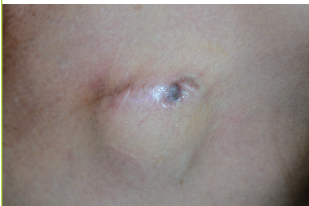
Fig. 2. Preoperative design around the exposed ICED

A defibrillator was exposed with mild capsular contracture and skin erosion 1.6 years after insertion. An erythematous skin lesion with mild tenderness around the wound was also noted.