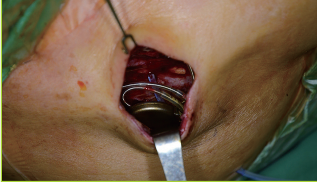
Fig. 4. Management before replacing the ICED

Careful temporary removal of the generator device from the pocket was performed, followed by gently untwisting the unbursed part of the leads. After untwisting the unbursed part of the leads, careful dissection and debridement of the entire fibrous capsule and all unhealthy granulation tissue surrounding the ICED were performed with Metzenbaum scissors. ICED, implantable cardiac electronic device.