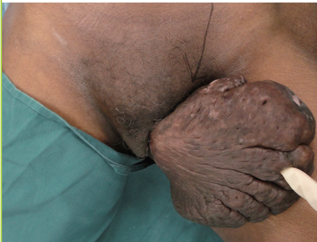
Fig. 2. Left vulvar squamous cell carcinoma

Appearance of the left labia majora massive localized chronic lymphoedema in 2011, prior to surgical resection. The resection specimen weighed 915 g.