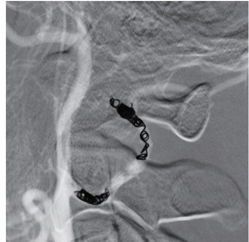
Fig. 4. Angiogram showing the afferent feeding vessel and pseudoaneurysm treated with endovascular coil embolization.

Tae Gon Kim http://orcid.org/0000-0002-6738-4630 Kyu-Jin Chung http://orcid.org/0000-0001-6335-1818 Jun Ho Lee http://orcid.org/0000-0002-0062-6420 Yong-Ha Kim http://orcid.org/0000-0002-1804-9086