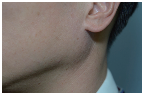
Fig. 1. Preoperative photograph showing a lesion on the left neck.

Most occipital artery pseudoaneurysms are consequences of trauma, or are secondary to