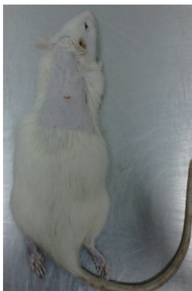
Fig. 2. Generating a third-degree burn wound

Rats were anaesthetized and the dorsal hair was shaved in a 3 \times 3 cm area.