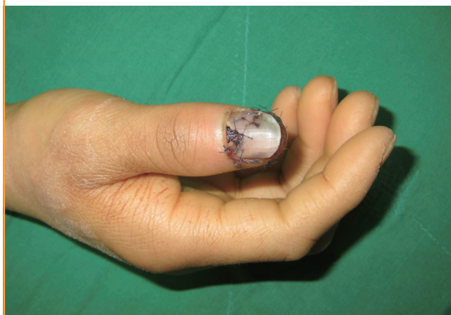
Fig. 6. 99m Tc-MDP 3-phase bone scan image

Skin necrosis on the right thumb was observed 3 days after the dog bite injury.