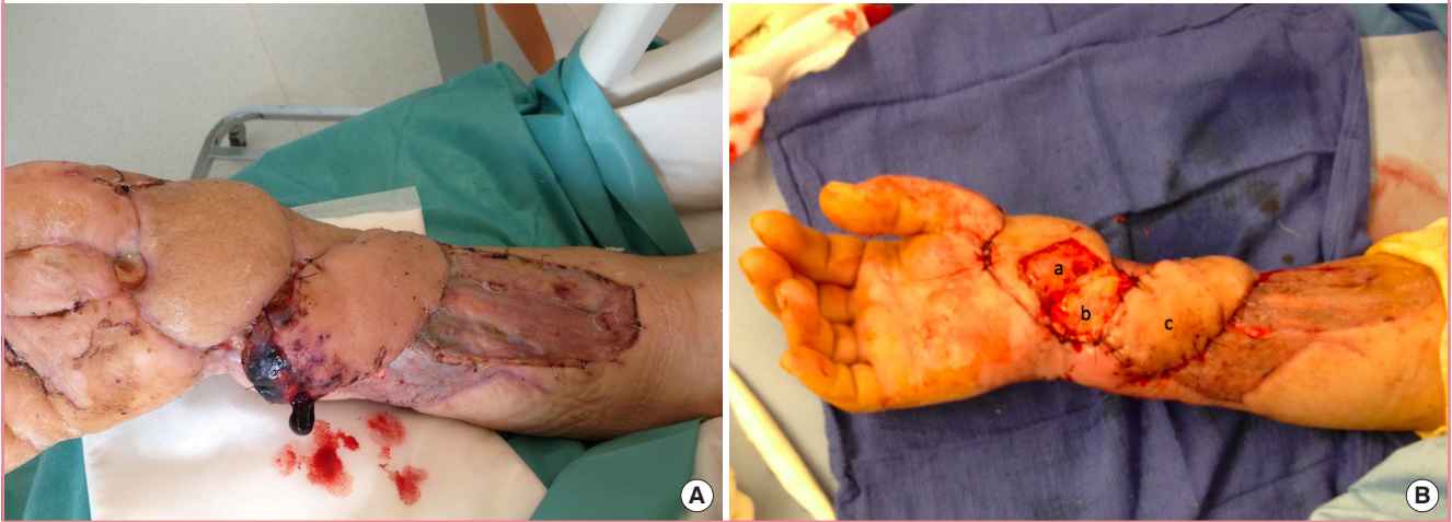
Fig. 3. Flip-flap puzzle flap for case 2

(A) Figure A shows the preoperative view of the patient's forearm with a distal necrosis of a radial collateral artery perforator (RCAP)-based perforator flap. (B) Figure B shows the immediate postoperative view of a flip-flap puzzle flap harvested from the interosseous posterior flap (a, donor site on the interosseous posterior flap; b, flip-flap puzzle flap; c, RCAP-based propeller flap).