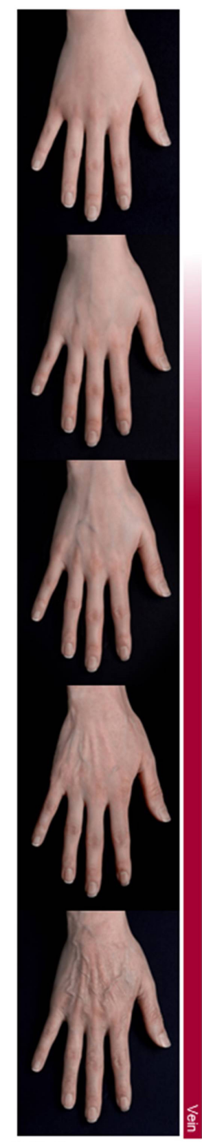
Fig. 1. The Hand Volume Rating Scale