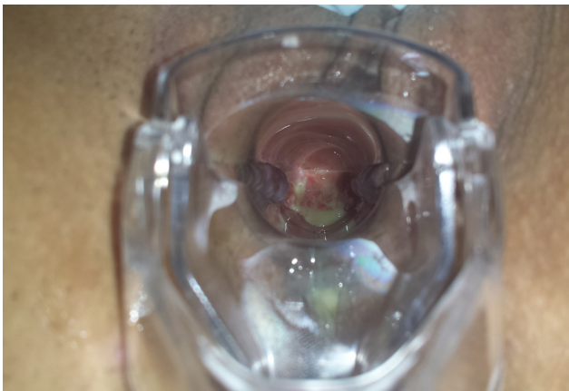
Fig. 4. Four years after the operation. The neovagina was well reconstructed with a soft, pliable, and easily extended mucosa lining.

shorter time for epithelization, the simplicity of the surgical technique, and also nearly normal sexual function outcomes [7].