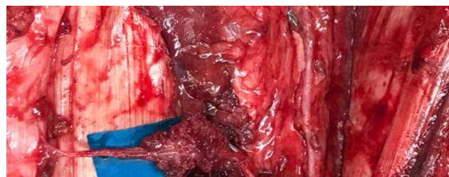
Fig. 1. Intramuscular dissection of the perforator.

All flaps except one survived well without partial loss of tissue. The