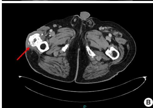
Fig. 2. Heterotopic ossification (red arrow) at the right thigh anterolateral thigh donor site. (A) Plain X-ray film. (B) Computed tomography scan.

sarcoma surgery, who agreed that the findings were consistent with heterotopic ossification and that histological confirmation was not required. The patient was reassured, and no further surgical intervention was sought.