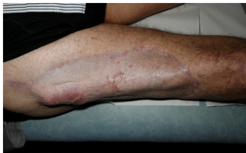
Fig. 1. Firm swelling at the proximal anterolateral thigh donor site.

Over the course of 9 months following radiotherapy, the patient slowly developed a painless swelling on his right thigh. On examination, he presented a hard, raised mass measuring 12 × 5 cm under the healed split-thickness skin graft on the ALT donor site (Fig. 1). The mass did not affect his mobility. Plain X-ray films (Fig. 2A) and a computed tomography scan (Fig. 2B) were obtained and evaluated by senior radiologists with experience in