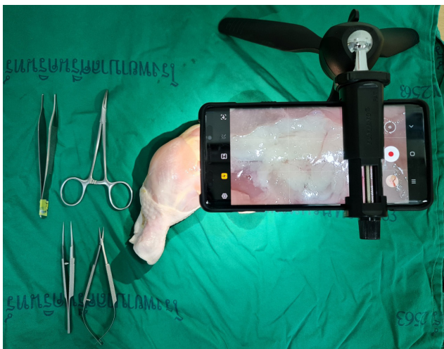
Fig. 2. Set-up of the operation under a smartphone.

For the experienced microsurgeon, the median operation time when using the smartphone was 32.5 minutes; this was significantly longer than the mean operation time of 20 minutes when using the microscope (Table 1). In subgroup analysis, the only significant difference in the mean operation time for the experienced microsurgeon was between using the smartphone and the microscope with 8-0 sutures ( P = 0.021 ). A subgroup analysis of the resident showed no significant difference in mean operation times between the smartphone and the microscope groups (Table 2). The operation time while using a smartphone by the resident was not significantly different when compared to the experienced microsurgeon ( P = 0.238 ). In contrast, the