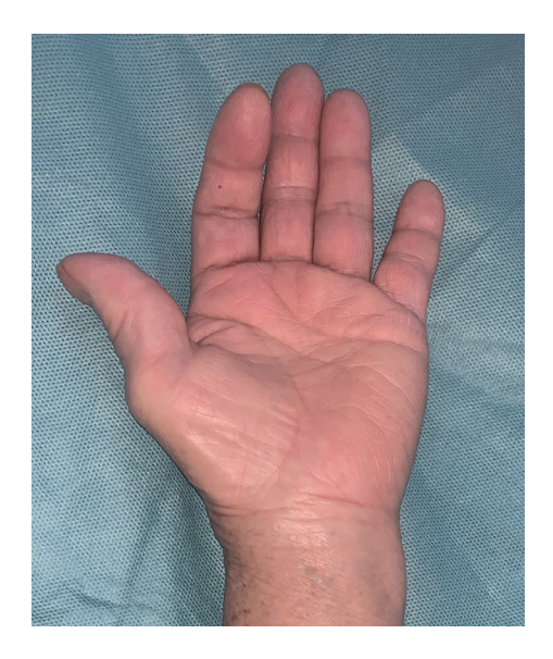
Fig. 1. Initial clinical photograph: the left hand of a patient with Kienböck disease.