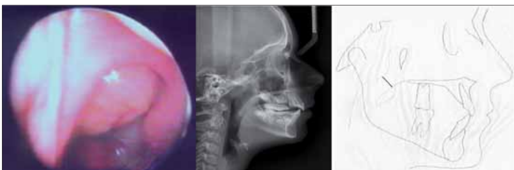
Figure 2. Grade 2 hyperplasia of the pharyngeal tonsils by nasofibropharyngoscopy and cephalometry (cephalometric analysis).