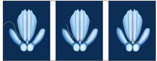
Figure 2. Fabrication of the lateral intercrural suture.