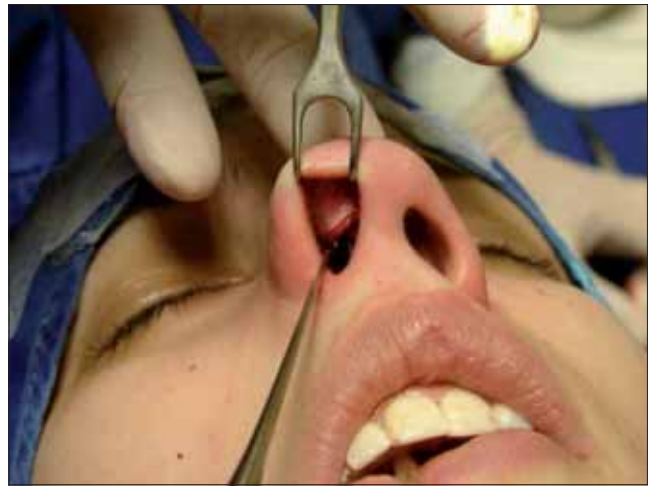
Figure 4. Step 1.

Skin thickness is another determining factor in the effectiveness of the lateral intercrual suture. In patients with thin skin and sparse subcutaneous tissue the results are more significant. However, in patients with thicker skin and excessive subcutaneous tissue, the lateral intercrual suture may be ineffective, thus requiring a reduction of the angle of domal divergence and of the domal definition by using other techniques, such as the Goldman Technique , transdomal suture, interdomal or medial crus suture, or a