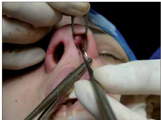
Figure 6. Step 3.