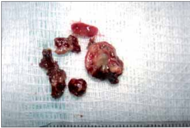
Figure 1. Surgical part after maxillary sinusotomy.