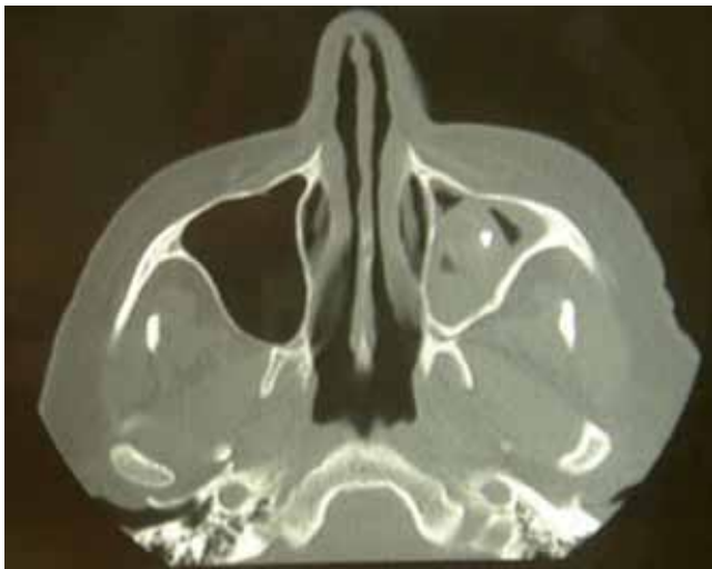
Figure 2. TC of face presenting thickening of the mucous covering of the maxillary sinus left and mass of density of soft parts with calcifications.