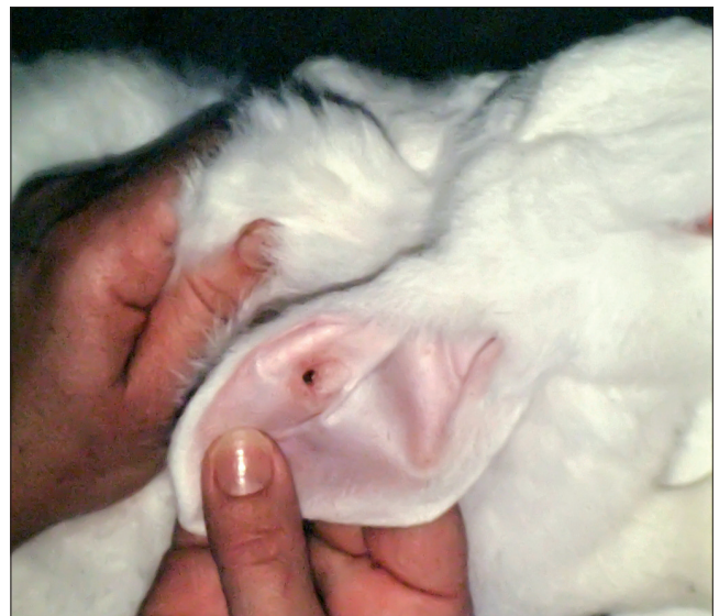
Figure 2. Handle with graft plasma.