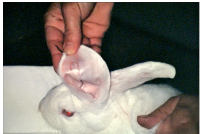
Figure 3. Handle with graft chemoprecipitate.